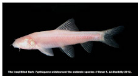
The Iraqi Blind Barb Typhlogarra widdowsoni the endemic species..jpg 60K