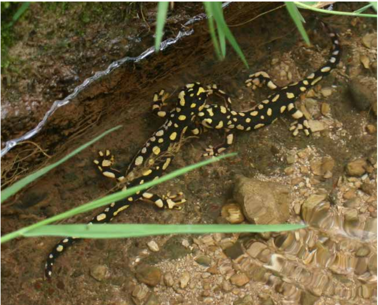
Fig. 4. Male (right) and female (left) N. crocatus in mountain stream at Grtk of Choman district in Erbil.

still thriving in suitable habitats in the northern mountains of Iraq, with locations concentrated mainly along the border with Iran. Our surveys extended the known range of N. microspilotus that included seven new locations in the mountains of northeastern Iraq. In addition, four new localities of N. crocatus were discovered in this region.