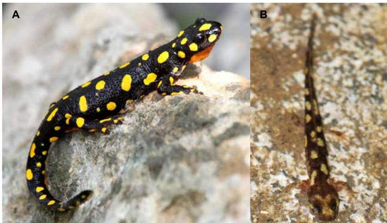
Figs. 2a and 2b. Neurergus microspilotus (a): adult male; (b): larva, Hero of Pshdar district.

An adult male along with 31 larvae were found in a mountain pond (elevation ca. 1400 m) in Ahmad Awa on 4 June 2012. Additionally, 11 individuals (seven males and four females) with 208 larvae in early metamorphic