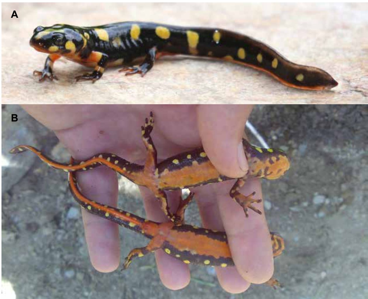
Figs. 3a and 3b. Neurergus microspilotus (a): juvenile at Halsho of Pshdar district; (b): Adult male (below) and female (above) in Qara mountain.

There is a paucity of information concerning Neurergus newts in Iraq. Neurergus newts have a restricted range and scattered distribution mainly confined to the habitat of the Zagros Mountain Forest Steep Ecoregion. Our 2007 to 2013 surveys suggest that Neurergus newts are