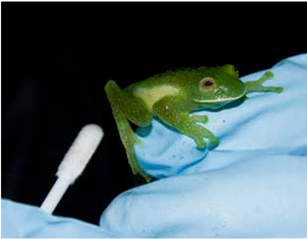
Fig. 1. Swab sample obtained from Centrolene heloderma at Reserva Las Gralarias, Ecuador.

Bd genome at the junction of the ITS-1 and 5.8S regions. We used a standard curve that included 1000, 100, 10, 1, and 0.1 zoospore genome equivalents, and followed qPCR conditions described in Boyle et al. (2004). For samples obtained during 2013, Bd presence was tested using the internal transcribed spacer regions (ITS-1, ITS-2) primers Bd1a (5'-CAGTGTGCCATATGTCACG-3') and Bd2a (5'-CATGGTTCATATCTGTCCAG-3') developed by Annis et al. (2004); the presence/absence of Bd was determined via the visualization of the amplified band in agarose gel electrophoresis. The two methods to detect Bd have different sensitivities; therefore, direct comparisons of Bd prevalence between years should be considered with caution. However, family and habitat correlates with infection status should not be biased by detection method, and qPCR offers the additional advantage of quantifying infection intensity (load).