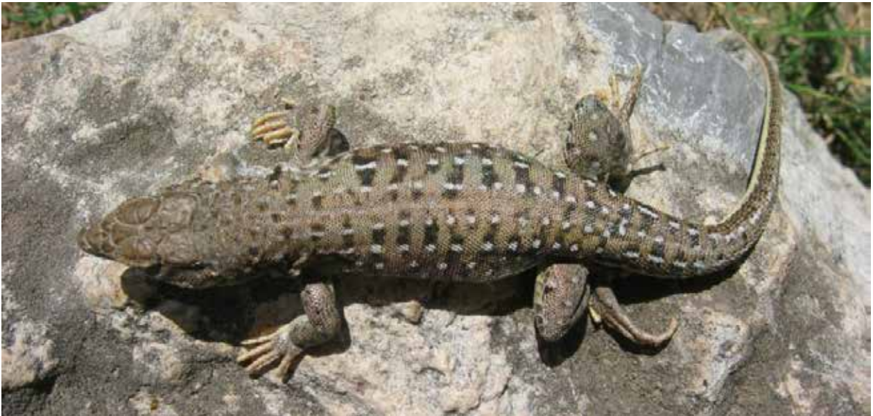
Figure 2. General view of Eremias suphani from Iran. The color pattern of this species is different from Eremias strauchi strauchi.