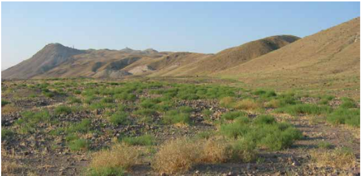
Figure 1. Habitat of Eremias suphani in NW Iran on the road from Firoragh to Chaldoran in Ali Sheykh village.

from Firoragh to Chaldoran, at the village of Alishekh (Fig. 1) (E 44° 34' 78.4", N 38° 49' 22.1", elevation: 1934 m). Four specimens were collected (SUHC 310-313) (Fig. 2) and deposited in the Sabzevar University Herpetological Collection (SUHC), Iran. The sites of the new records near the border of Iran-Turkey are provided in Figure 3. Turkish specimens were collected from three different localities in 2010 and 2012 (Aydınlı Village, Adilcevaz, Bitlis—between Tatvan and Bitlis km 4, Bitlis—Hoşap, Güzelsu, Van). They were deposited in the Biology Laboratories of Dokuz Eylül University, İzmir, Turkey.