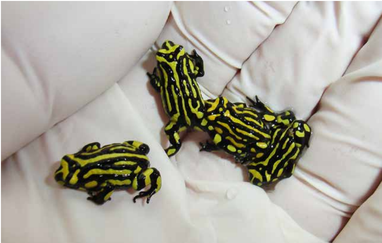
Fig. 8. Southern Corroboree Frog metamorphs.