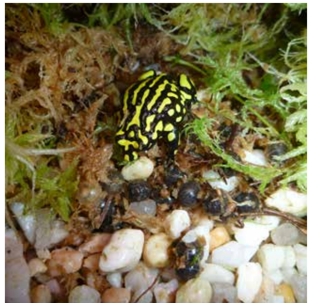
Fig. 5. Captive nest containing eggs.

On 04 April, a total of 698 eggs were removed from 13 nests in seven tanks in the main breeding facility (Table 1). An additional 25 eggs were laid in a tank of males and females of mixed age in a second facility not detailed above. Number of eggs in each nest varied from 10–90, indicating one to three clutches being laid in each nest. Unlike 2011, there was no difference in the number of eggs produced between the two older cohorts of females, aged two years apart. Overall, 78% of embryos from these cohorts survived until hatching. However, four year old females showed lower fecundity, with only two clutches produced and 62% embryo viability until hatching. In 2012, 447 eggs at hatching stage were released and a small number were retained at TZ.