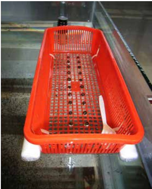
Fig. 4. Floating hatching tray on a tadpole rearing tank.

from the bottom of natural pools within the species' habitat. Prior to use, the silt was heated to 40 °C for 24 hours to kill chytrid fungus zoospores (Johnson et al. 2003), a process which still allows algae to survive and grow. As well as feeding on algae, tadpoles were offered a diet of frozen endive twice per week and a 75:25 mixture of finely-powdered Sera Flora and Sera Sans fish flakes, three to four times per week. This tadpole diet has been utilized at TZ since 2007, with the heat-treated natural silt first added to tadpole rearing tanks at MZ during the 2009 breeding season. Prior to that, only endive was offered. In 2012, MZ also added finely crushed spirulina wafers.