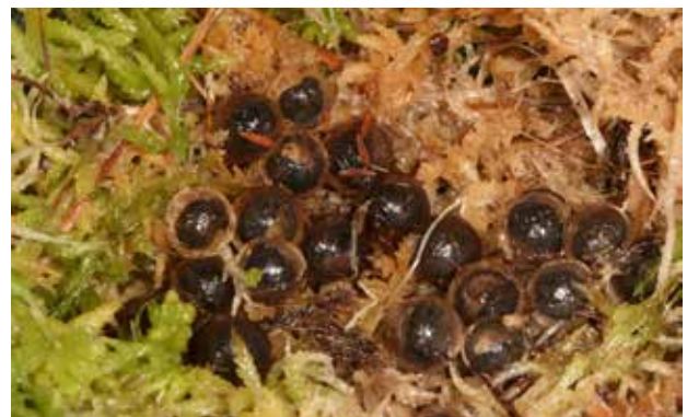
Fig. 6. Southern Corroboree Frog eggs.

At both zoos, male frogs can be heard calling at two years of age, though most males matured at three to four years. Earliest female breeding at TZ was from a single three year old frog from 19 individual females in this age group.