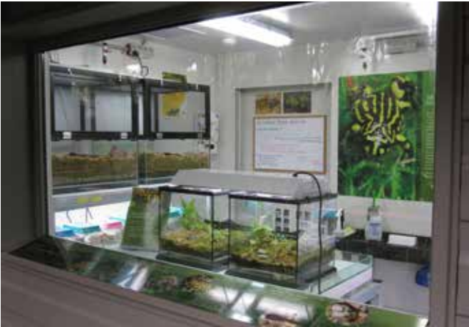
Fig. 2. Endangered amphibian complex at Melbourne Zoo.