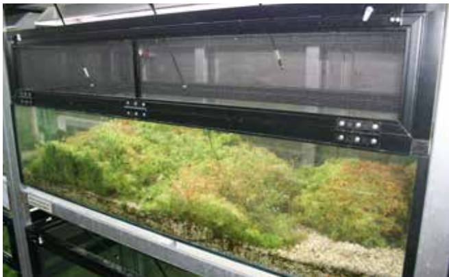
Fig. 3. Corroboree frog breeding enclosure at Taronga Zoo.