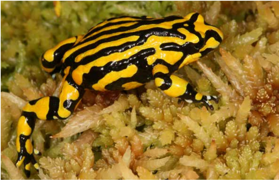
Fig. 1. Adult Southern Corroboree Frog.