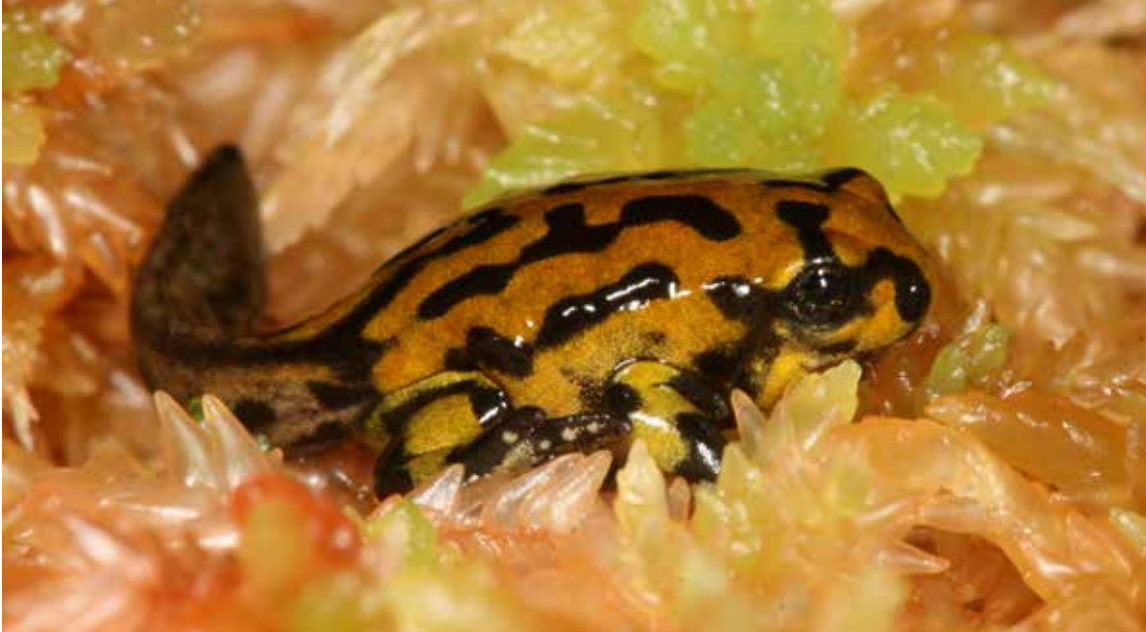
Fig. 7. Metamorphosing Southern Corroboree Frog.