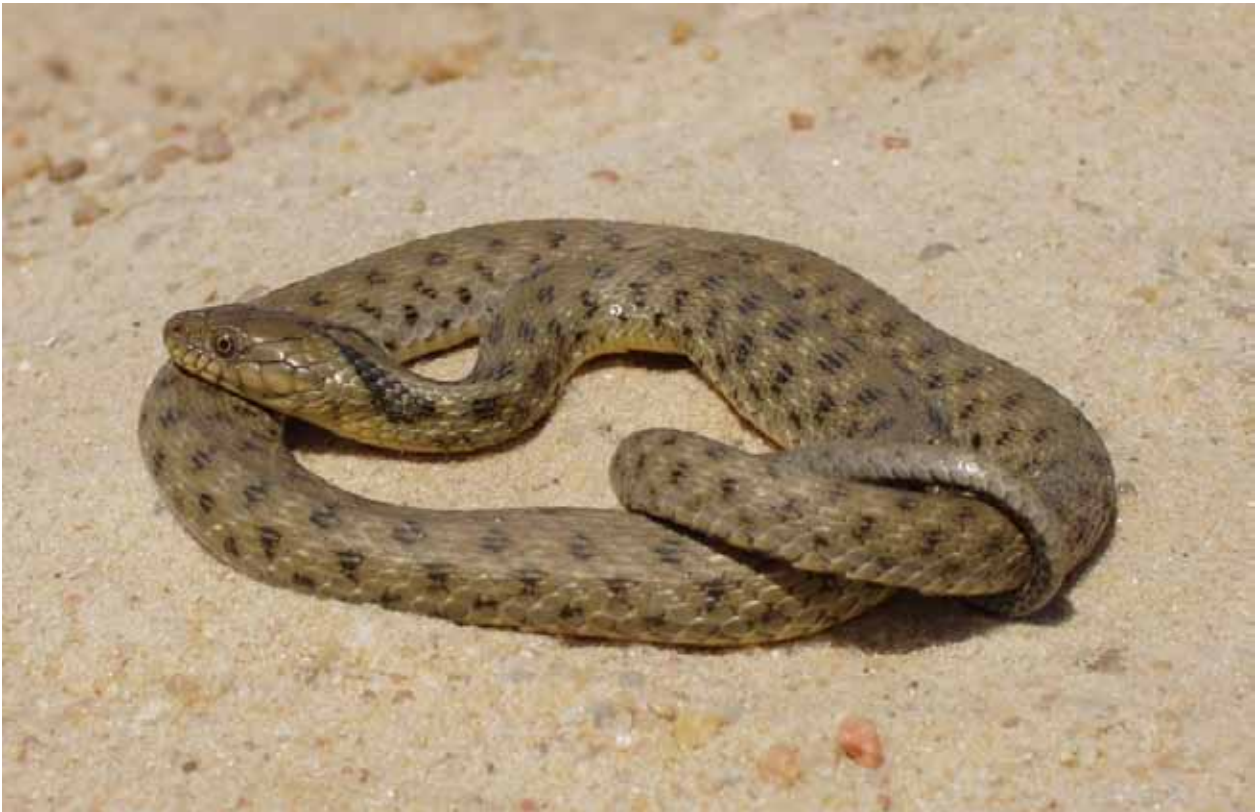
Figure 1. Natrix tessellata , Ismailia city, 7 August 2007.