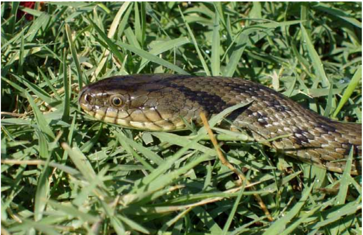
Figure 2. Natrix tessellata , Déversoir, 24 May 2008.