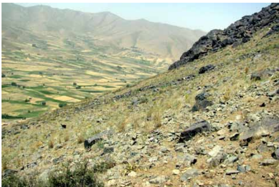
Figure 2. The natural habitat of Eremias (Eremias) montanus (new record) in Badr and Parishan highlands, at about 2466 m elevation.