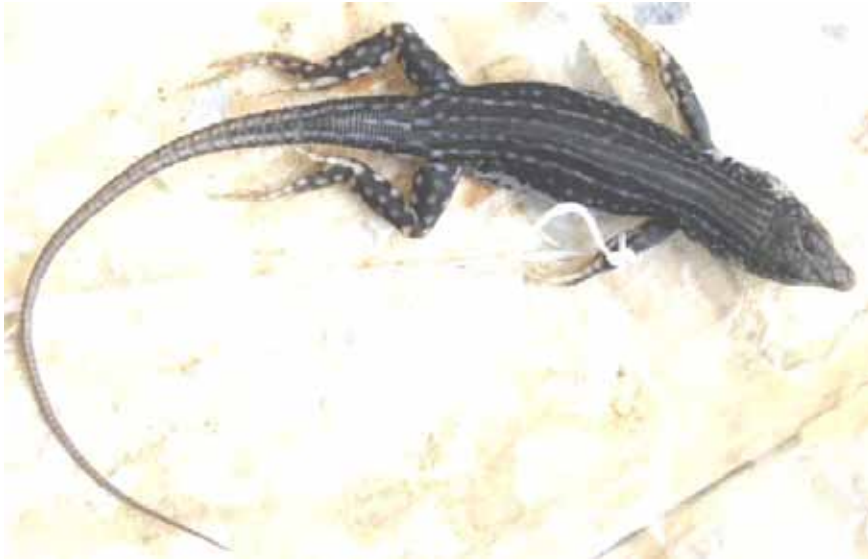
Figure 3. Dorsal view of the collected specimen of Eremias (Eremias) montanus .

stripe bifurcating on the nape, a single paravertebral stripe on each side and two dorsolateral stripes containing light spots; venter dirty-white; the proximal lower caudal region being whitish-gray, becoming lighter distally. The collected specimen is preserved in 75% alcohol and is deposited at the collection of the Razi University Zoological Museum (RUZM-LE30.7) (Fig. 3).