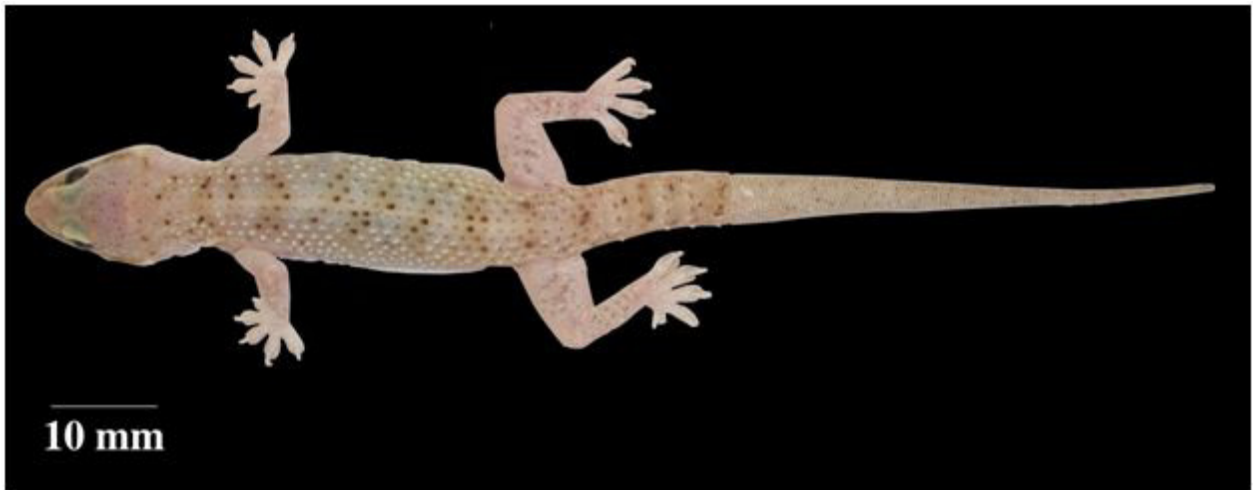
Figure 2. One of the three collected specimens of Hemidactylus turcicus from southwestern regions of Fars Province.