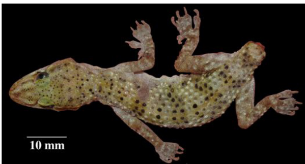
Figure 3. A specimen of H. persicus with autotomized tail from Shiraz, the capital of Fars Province.