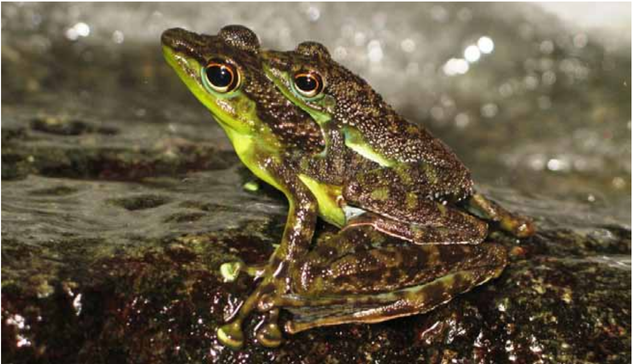
Figure 1. Male and female Staurois guttatus in amplexus resting at a waterfall.

Many stream living anuran species in Borneo show morphological and behavioral adaptations to torrential streams and waterfalls. For example, the tadpoles of Huia cavitympanum and of all species of the genus Meristogenys have large abdominal suckers specialized for a life in currents (Haas and Das 2012). The adult males of M. orphnocnemis use high frequency calls to communicate in noisy stream environments (Boeckle et al. 2009; Preininger et al. 2007). An extraordinary spectral adaptation to enhance the signal-to-noise ratio has also been reported in Huia cavitympanum , in which males call in a band of ultrasonic frequencies (Arch et al. 2008). In the vicinity of waterfalls and fast-flowing streams, species of the genus Staurois display an exceptional behavior termed, “foot-flagging” (Grafe et al. 2012; Grafe and Wanger 2007; Preininger et al. 2009). The conspicuous visual display mainly observed in tropical anuran species inhabiting riparian habitats (reviewed in Hödl and Amézquita 2001) may act as a complementary mode of communication in noisy habitats.