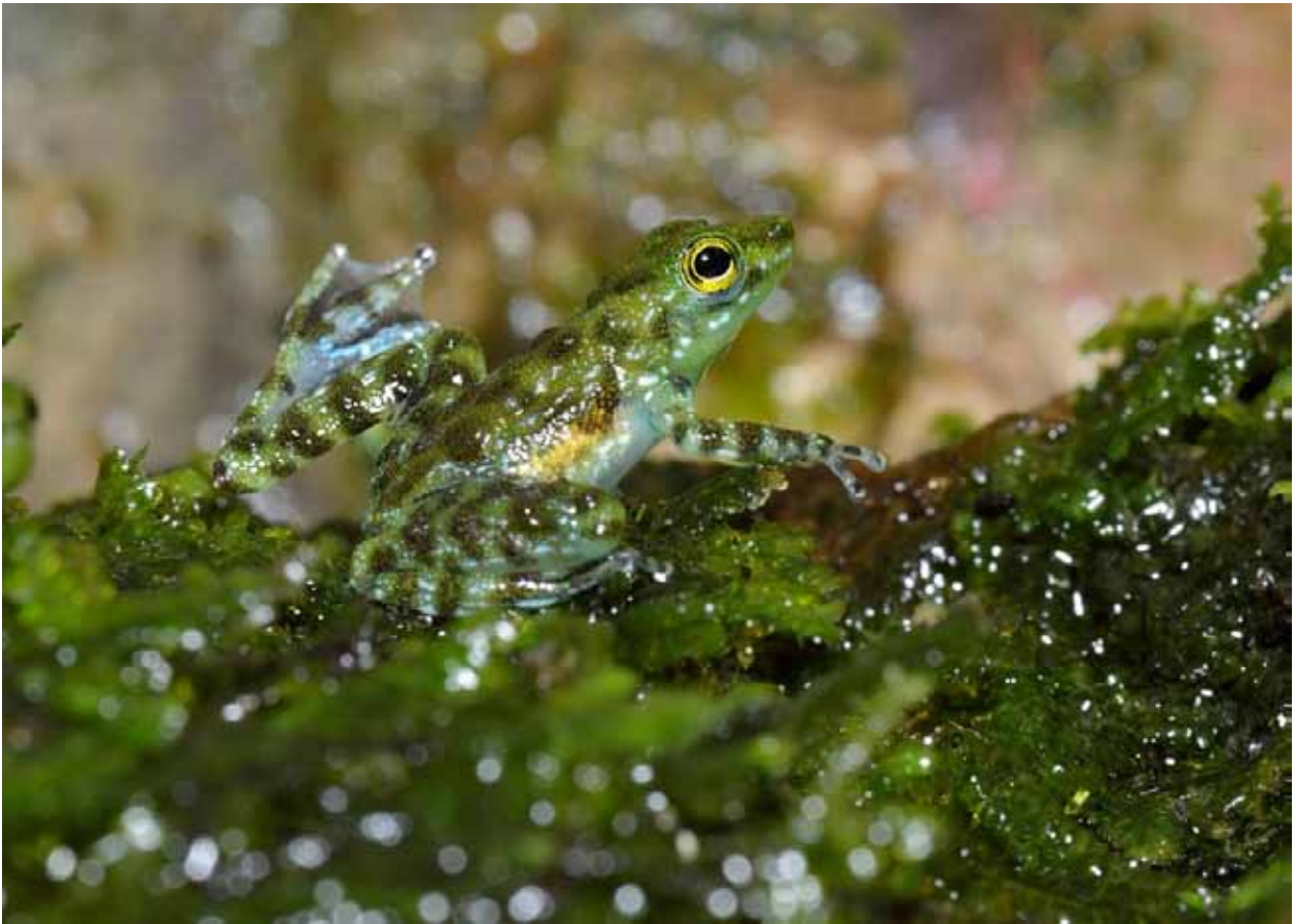
Figure 10. Juvenile Staurois parvus performing a foot-flagging behavior. Interdigital webbing are transparent grey and not white as observed in adults (see also Fig. 2).