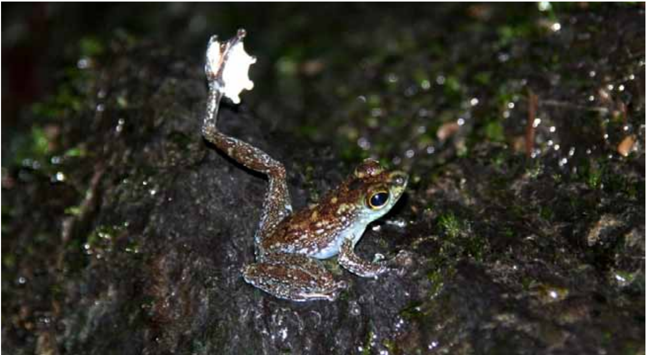
Figure 2. A male of Staurois parvus displaying the white interdigital webbing during foot-flagging behavior. The visual signals are mainly employed during male-male agonistic interactions.