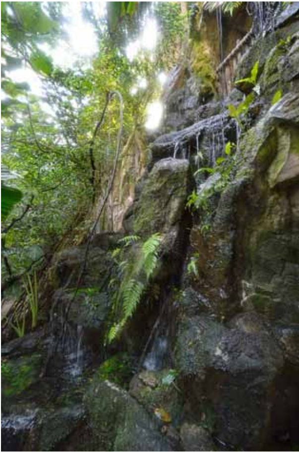
Figure 9. Artificial waterfall habitat at the Borneo Rainforest-house in the Vienna Zoo.

pool from the S. parvus breeding terrarium and still observe freshly hatched tadpoles.