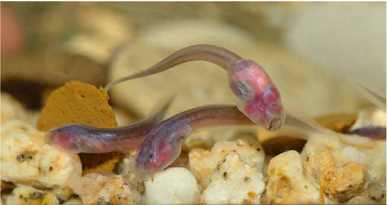
Figure 11. Tadpoles of Staurois guttatus .