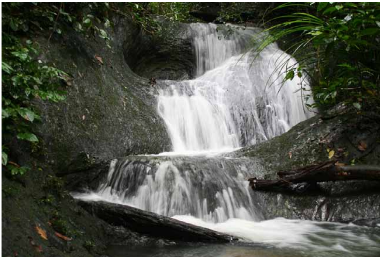
Figure 3. A waterfall habitat of Staurois guttatus at the Sungai Mata Ikan (“Fish-Eye” River) in the Temborong District in Brunei, Borneo.

Aglaonema sp., Scindapsus sp., and others) as nightly resting sites. We incorporated a self-built rain and misting system to simulate rainy and dry periods. The water area, which covered the entire floor of the terrarium, was filled with gravel of different grain sizes and larger pebbles that provided perching sites and interstitial spaces. We further installed two smaller glass containers (30 × 30 × 30 cm), one placed directly under the waterfall mimicking a constantly flushed pool with large stones, and the other containing sand, dead leaves, and standing water, as found in side ponds of waterfalls. A mixture of osmosis-purified water and drinking water (average conductivity = 9 μS/cm, pH = 7.2) was discharged via the waterfall and drained into an external filter reservoir, which created a slow current in the main water area. As light source we used a metal-halide lamp (HIT-DE 70 Watt [Daylight]) and placed several plastic boards on top of the terrarium to mimic canopy coverage. Individuals were housed under 12-hour light, 12-hour dark cycles. We placed five pairs of S. parvus into the arena. From then on individuals could only be counted at night when perching on leaves, while frogs rested in the many hiding places during the day.