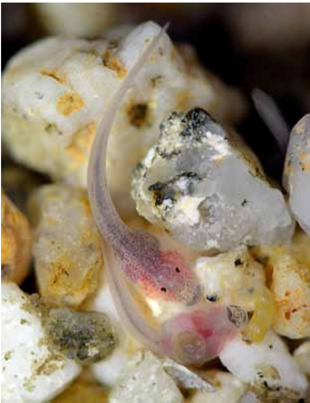
Figure 7. Tadpoles of Staurois parvus .

The diversely structured artificial habitat in the breeding tank offered individuals similar conditions as observed in the natural habitat. Earlier studies that kept adults of S. parvus in terrariums of simpler design (no flowing water) showed that individuals did not display acoustic or visual signals under such conditions (R. Kasah, pers. comm.). At the beginning of our project we kept individuals pair-wise in simpler terraria with a small water area containing no gravel and only larger pebbles, some tree branches, flowing water via a pump, and temperatures of 23-25 °C. Under these conditions individuals performed advertisement calls and foot-flagging behavior but no reproductive behavior could be observed. Especially in S. guttatus females displayed territorial calls and foot flags if males approached, a behavior that was interpreted as a spacing mechanism (Preininger et al., data not shown). After transferring all individuals in the considerably larger and diversely structured breeding tank, calling activity intensified, and pairs in amplexus could be observed after a few weeks. Hence, we suggest that first and foremost the gravel containing flowing water area was crucial for reproduction, but also the simulated dry and rainy season might have had an effect. It is now essential to alter or exclude single environmental conditions or habitat structures to determine factors necessary for reproduction. So far we have removed the artificial side pool and flushed