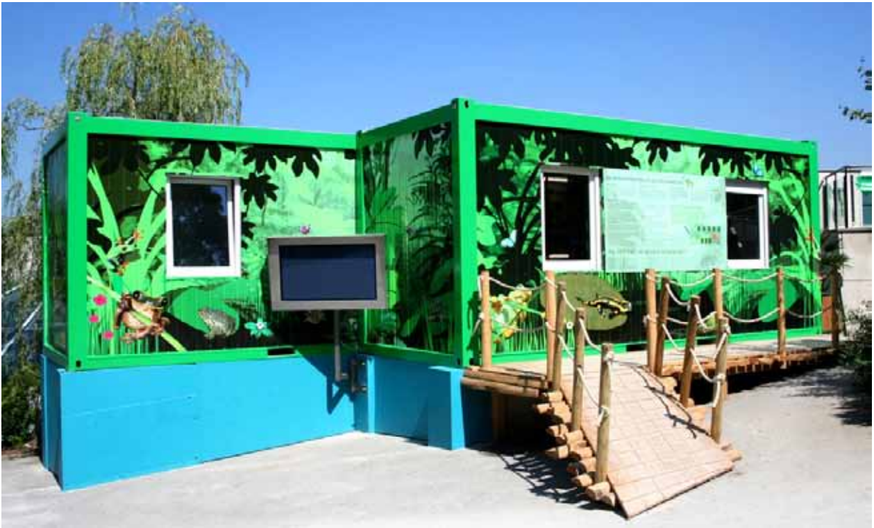
Figure 4. The bio-secure container facility a modern Noah's Ark, which houses Staurois guttatus and S. parvus at the Vienna Zoo Schönbrunn.