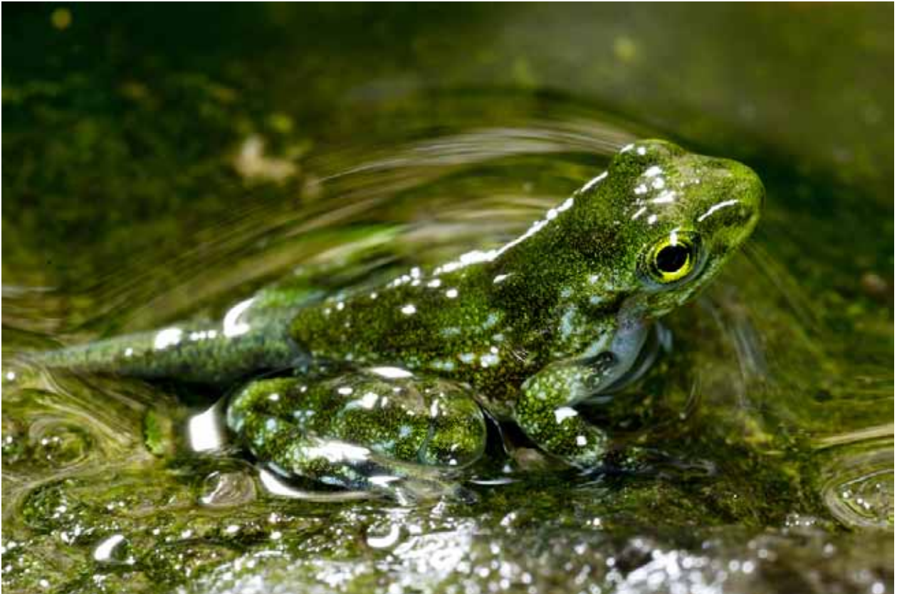
Figure 8. Juvenile Staurois parvus .

The diversely structured artificial habitat in the breeding tank offered individuals similar conditions as observed in the natural habitat. Earlier studies that kept adults of S. parvus in terrariums of simpler design (no flowing water) showed that individuals did not display acoustic or visual signals under such conditions (R. Kasah, pers. comm.). At the beginning of our project we kept individuals pair-wise in simpler terraria with a small water area containing no gravel and only larger pebbles, some tree branches, flowing water via a pump, and temperatures of 23-25 °C. Under these conditions individuals performed advertisement calls and foot-flagging behavior but no reproductive behavior could be observed. Especially in S. guttatus females displayed territorial calls and foot flags if males approached, a behavior that was interpreted as a spacing mechanism (Preininger et al., data not shown). After transferring all individuals in the considerably larger and diversely structured breeding tank, calling activity intensified, and pairs in amplexus could be observed after a few weeks. Hence, we suggest that first and foremost the gravel containing flowing water area was crucial for reproduction, but also the simulated dry and rainy season might have had an effect. It is now essential to alter or exclude single environmental conditions or habitat structures to determine factors necessary for reproduction. So far we have removed the artificial side pool and flushed