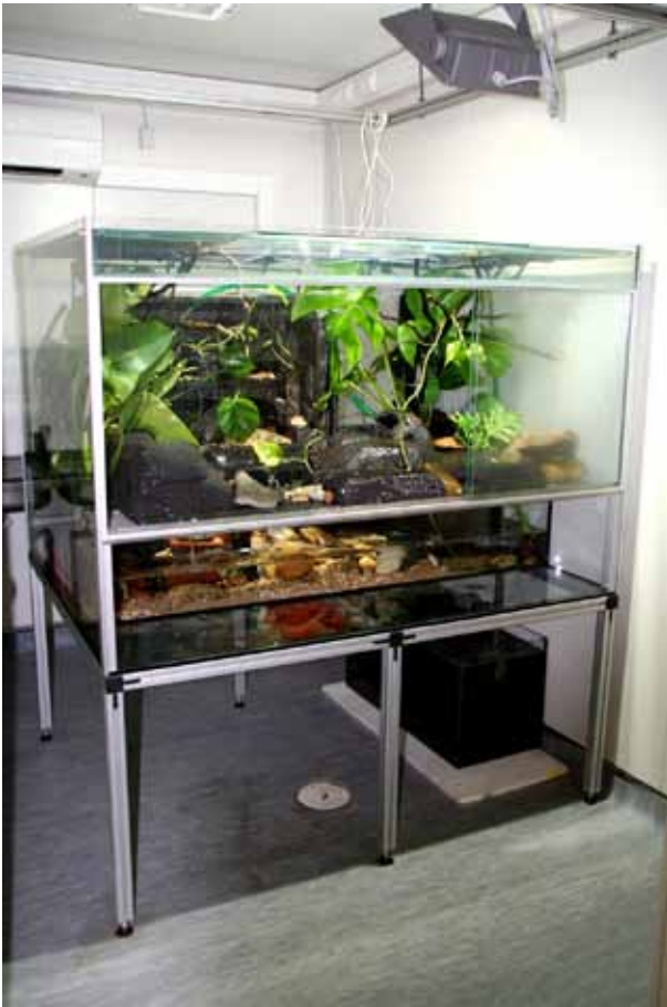
Figure 5. Ex situ breeding facility designed to offer different egg deposition sites (described in detail in the Methods section).