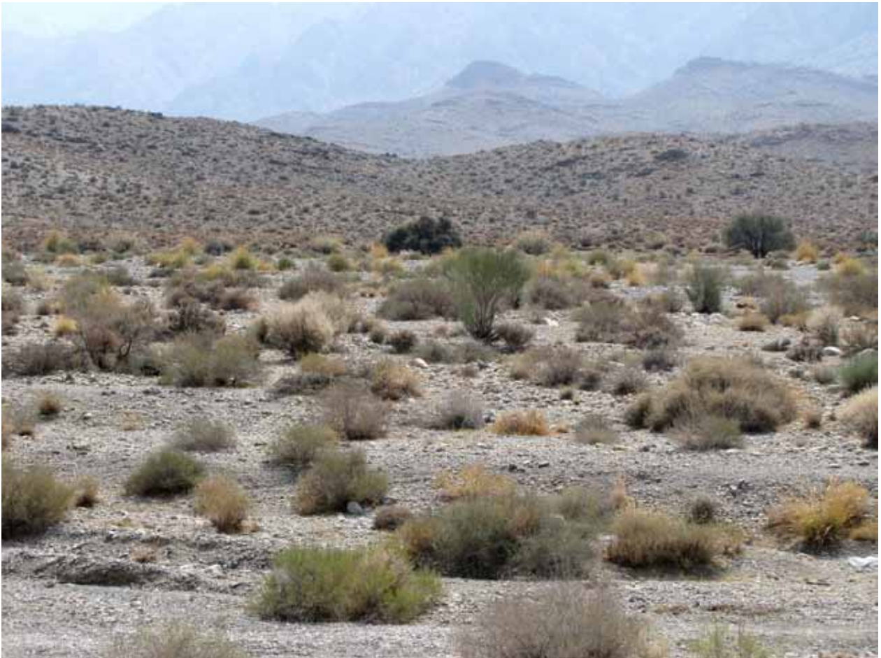
Figure 2. Habitat of Eublepharis angramainyu .

Western specimens seen in the wild were found in rocky deserts and arid grasslands. They occur in the small caverns in the gypsum deposits (Karamiani et al. 2010). The habitats are similar despite the wide distances between localities except for elevational range (1868 m instead of 300-1427 m).