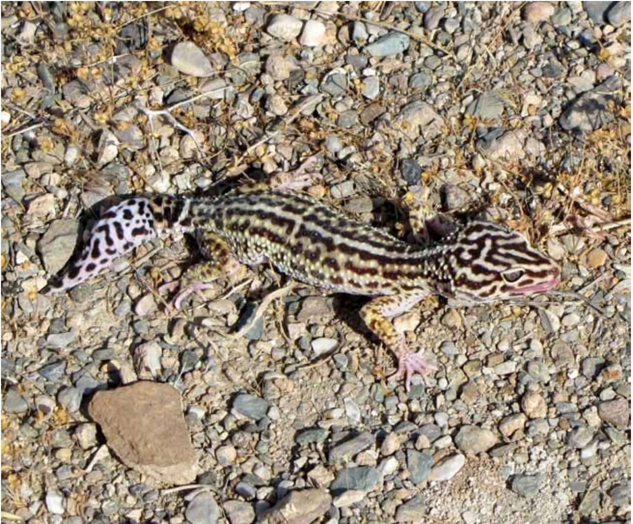
Figure 1. Eublepharis angramainyu .